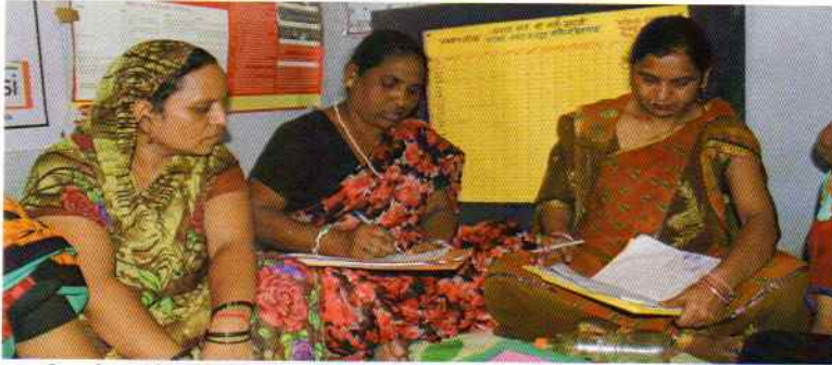
Action India initiated Mahila Panchayats in 1994

Indian women have “broken the silence” on domestic violence, protesting dowry killings, rape, and sexual harassment. These campaigns, fueled by grassroots women’s action, have resulted in promising changes in legislation and progressive laws such as PWDVA, 2005, the PCPNDT Act, and the 2013, “Sexual Harassment at Work Place.”